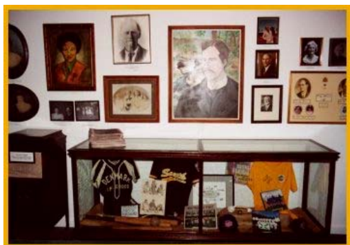
Part of the lobby exhibit