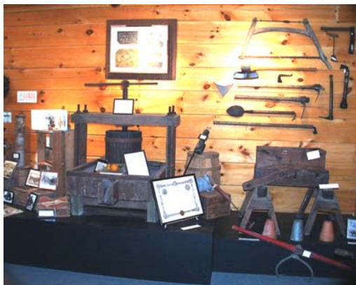
Part of Citrus and Cattle exhibit